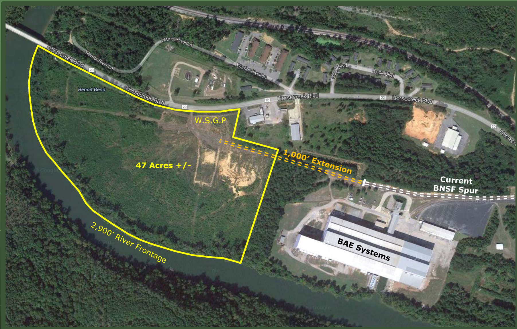
Warrior River Steel – Site Aerial